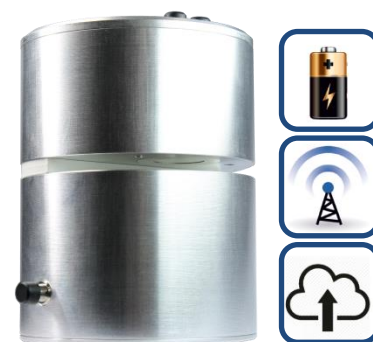
LA-1t LED analyser